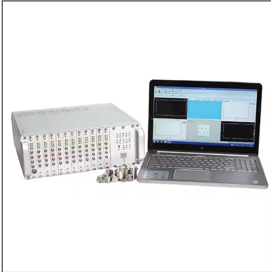
Acoustic Emission Testing (AE) Equipment

Practical sessions will be organized during the course for delegates to practice the theory learnt. Delegates will carry out NDT inspection using our “Acoustic Emission Testing (AE) Equipment” suitable for classroom training.